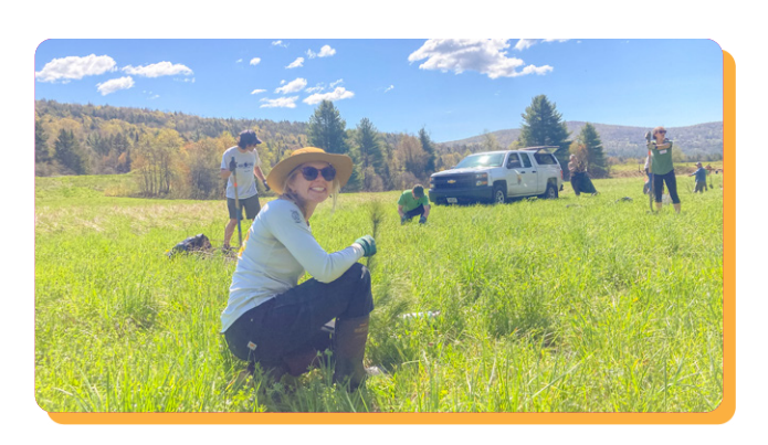
Tree planting community service day, 2021

After a year in which we were not able to safely gather with our full team, our all-staff community service day in May 2021 was just the right medicine. We planted over 3,200 trees in less than four hours, as well as built a pergola and a new nursery at local community gardens. We also hosted two service activities with local VT and NY food bank partners to expand the impact of our annual Holiday Giving Campaign.