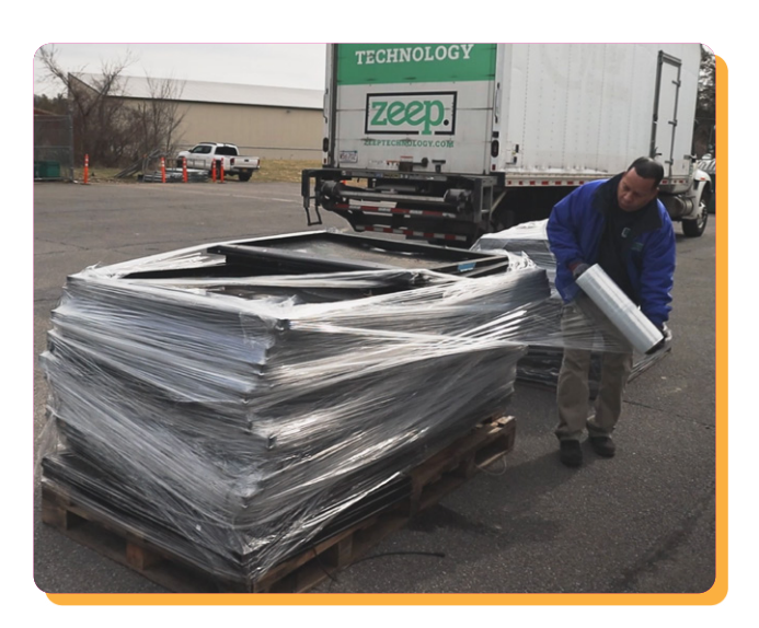
Solar module recycling, Kingston, NY

As a leading solar engineering, procurement, and construction outfit, our business operations inevitably create waste. In addition to our construction waste, we are now tracking our electronic waste (specifically solar modules that are either past their useful life or damaged). It is our goal to continually improve our waste management and reduce landfill material.