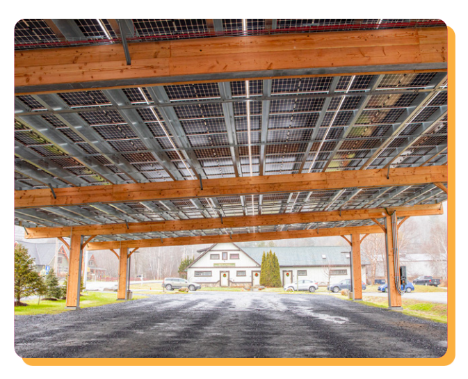
Solar Canopy, Lawson's Finest Liquids, Vermont

We have steadily increased the growth of our commercial solar business since 2016. This year we helped farms, food hubs, schools, breweries, a salvage yard, a nut roaster, and a radio station go solar, among others. 31 businesses in total. Businesses' electricity costs are substantial, so solar not only provides tangible savings for their bottom line but also supports their environmental goals. Our commercial solar program offers businesses of all sizes