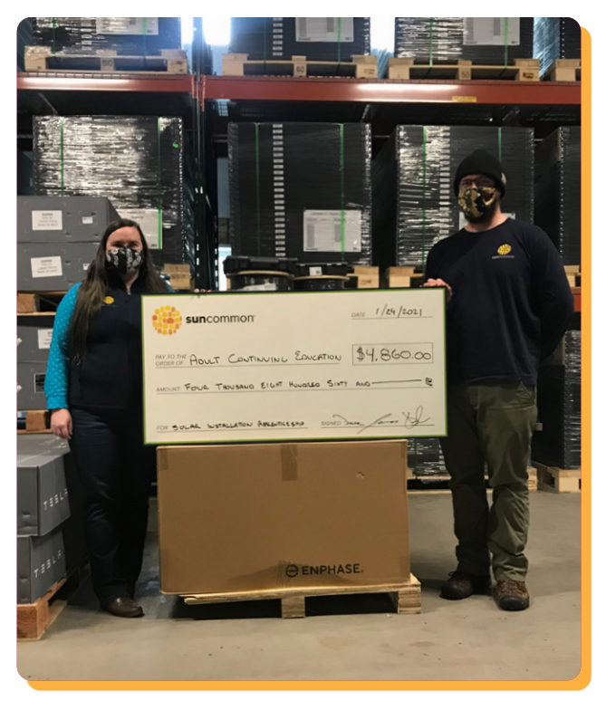
Holiday giving campaign check presentation to the Vermont Technical College Adult Continuing Education for green jobs training.

Over the years we've donated some of our revenue to support various organizations, causes, and events in our local communities. As the volume of requests has increased over the years, we've realized that we can expand our mission impact even more through our giving. In 2021, we began to clearly outline a program to help guide internal decisions around giving with a clear focus on partnership with others addressing our climate crisis.