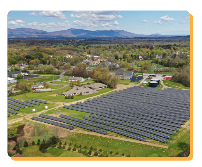
CSA, Red Hook, NY

We strategically scaled back our Community Solar program in 2020 as we believe the best community solar projects are modest in scale, from a few hundred kW to a megawatt or two. Policy shifts at the state level in both Vermont and New York have made it challenging for us to develop projects of our ideal scale while also providing savings for our customers. There is still interest in building these projects, and we will continue to explore options of how we can innovate to build viable projects. One such success in 2021 was with Radio Kingston